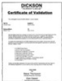
N520 - Certificate of Validation Certificate of Validation