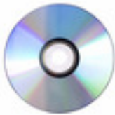
SW701 - Software Upgrade DicksonWare Software Upgrade