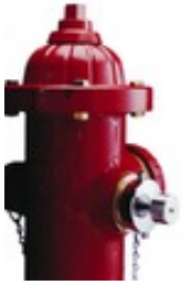
A793 - Hydrant Kit Fire Hydrant Adapter Kit