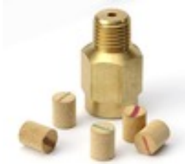
R022 - Pressure Filter Kit Filter Kit includes Snubber